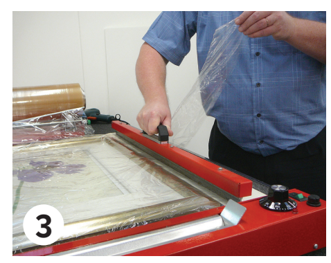
Seal and cut film to front

Next, position the object so that the front edge is over the other strip of silicone foam. Press down again with the Sealing Arm, and pick up and peel away the surplus film.