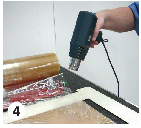
Apply heat to film on back of frame

To start, turn the object over and blow hot air onto the back — this will pull the seams around so they don't show on the front. Practice to find the appropriate amount of hot air to blow on the film. The more the hot air the faster the shrink, but too much will cause the plastic to melt and holes appear. Keep it moving, and do not aim at the seams or the corners, as these are the weak points.