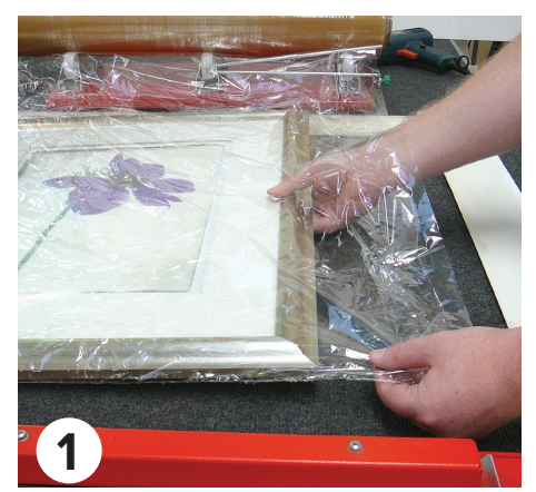
Slide frame between film layers and to left

Finding the correct temperature setting is essential for successful working. Users may find that they need to make adjustments to suit slight variations in the thickness of different materials and in ambient temperature.