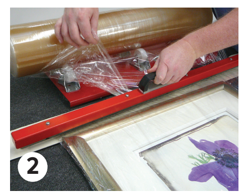
Use Wand to seal a long side

Switch on the base unit and allow to warm up, taking about 10 minutes. A trial with the material you are using will tell you when it has reached working temperature.