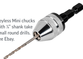
HSS 1/4" Hex Shank drills pop straight into most electric screwdrivers. See Ebay.