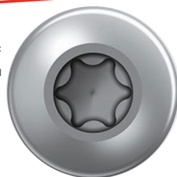
The detailed design of the Torx indent in the top of every Torx head screw. Screw sizes vary and have matching Torx driver.