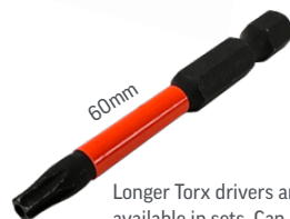
Longer Torx drivers are available in sets. Can be more convenient to use.

All packs have a matching Torx head, 25mm, included