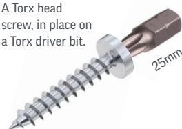
A Torx head screw, in place on a Torx driver bit.