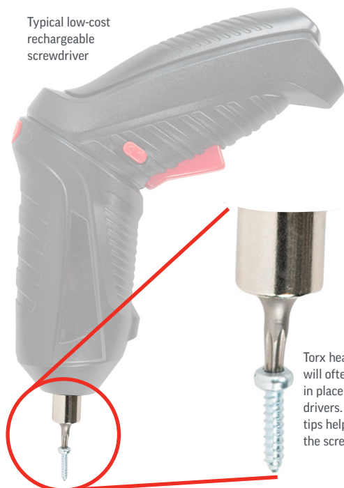
Torx head screws will often stay in place on Torx drivers. Magnetic tips help to hold the screw.