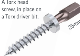
A Torx head screw, in place on a Torx driver bit.