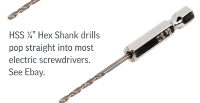
HSS 1/2" Hex Shank drills pop straight into most electric screwdrivers. See Ebay.

All packs have a matching Torx head, 25mm, included