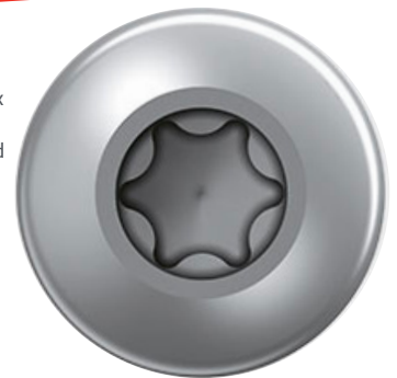
The detailed design of the Torx indent in the top of every Torx head screw. Screw sizes vary and have matching Torx driver.