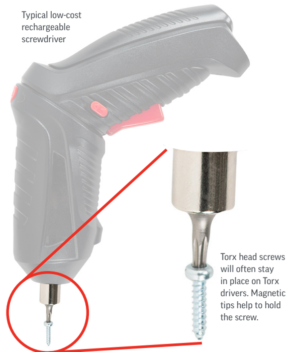
Torx head screws will often stay in place on Torx drivers. Magnetic tips help to hold the screw.