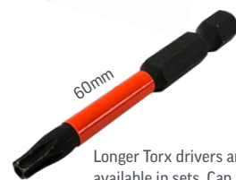
Longer Torx drivers are available in sets. Can be more convenient to use.