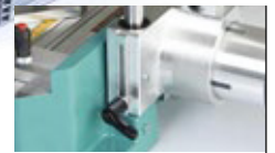
Milling height adjustment