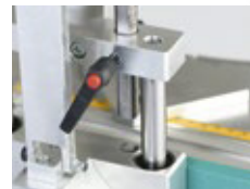
Milling depth adjustment